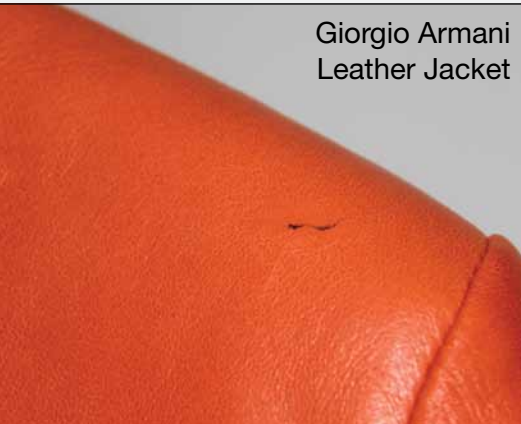
Giorgio Armani Leather Jacket