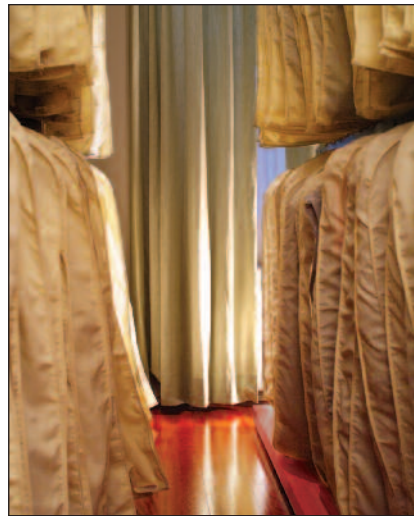
Garde Robe Storage

Once again, breathable sweater bags and garment bags for hanging items are your best bet. Folding knits for long term storage is a must.