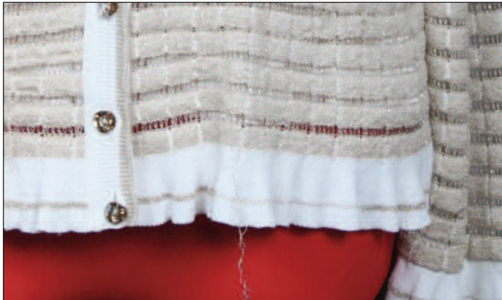
Before & after of snag repair

Additional restoration processes may include brightening to restore the original brightness or dyeing to change or restore the color. It is best to leave these more complicated processes to the professionals.