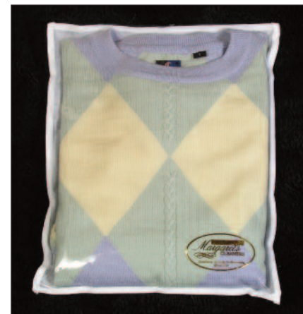
Breathable Sweater Bag

It is doubly important that items be stain-free before returning them to the closet. Recent or fresh stains may be easy to remove, however soiled items returned to the closet may not be discovered for months. This makes stain removal difficult and sometimes impossible. Carefully inspect the item for soil in good lighting before storing. Be sure to have stained garments cleaned before returning them to the closet.